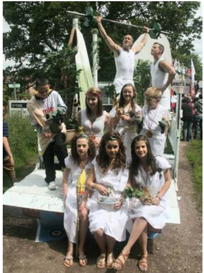
The Olympic Gods win Best Adult Float at the Naphill & Walter's Ash Float

"I am delighted to share this great moment of joy and achievement. We are all very proud of your service to our community and our country."