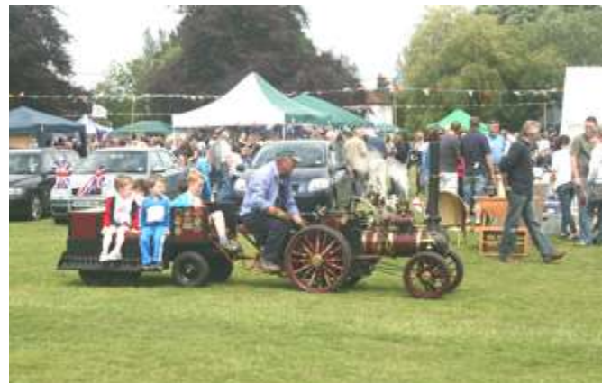
Always a favourite, the steam traction engine