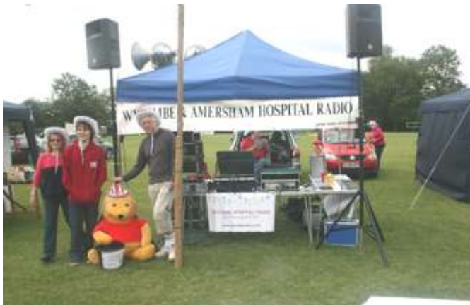
Wycombe and Amersham Hospital Radio