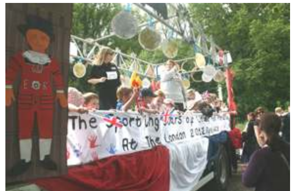
Best junior Float – Little Ash Pre School