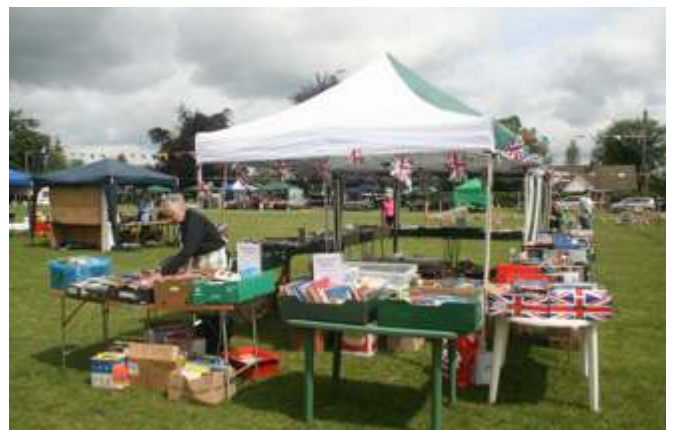
A little light reading