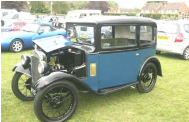
Classic Cars on show