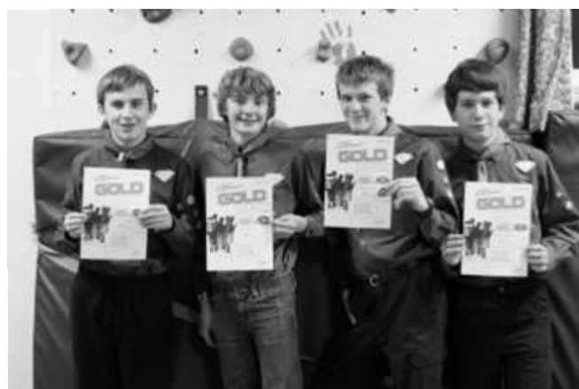
Four scouts from Naphill and Hughenden Scout Troop are awarded their Chief Scout's Gold award.