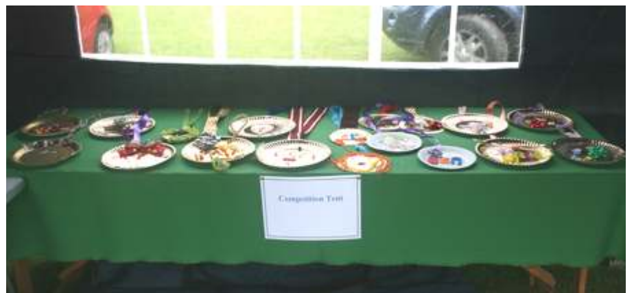
Artistic entries in the Competition Tent