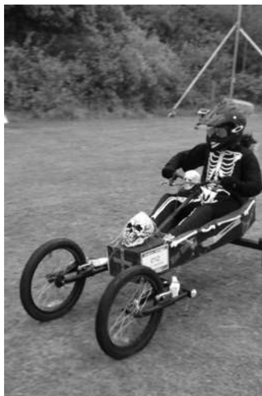
The Kop Hill Coffin on Wheels!