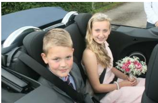
The Royal Party arrives in style to open the fete