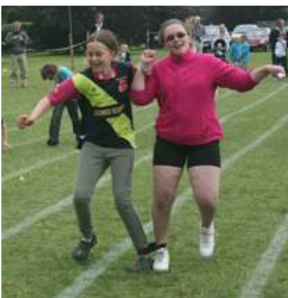
Three legs are better than