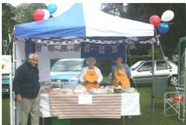
A delicious selection of cakes from Naphill Neighbours