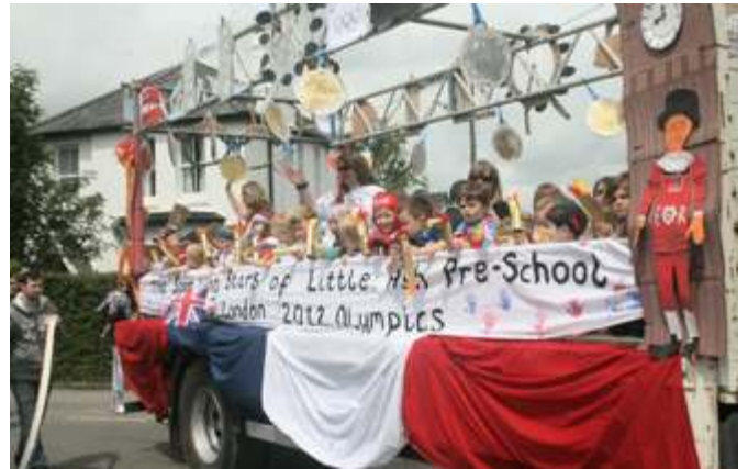
There could be a future Olympic medallist here!