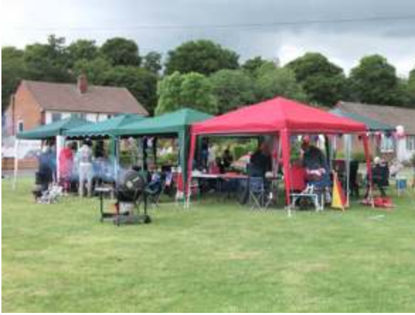
Gazebos were erected in the middle of Ash Close Green

Food and drink was brought out and shared around, and we had some amazing Jubilee cakes and biscuits! One or two barbecues were on the go throughout the afternoon, plus a very welcome wood-burning stove to keep the chilly breeze at bay! That said, we probably had the best of the weather over the Jubilee weekend!