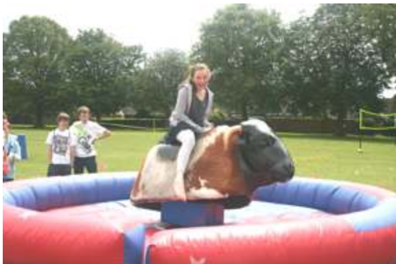
The Bucking Bronco in action

The crowds arrived on the Crick, which looked very impressive with such a large amount of stalls and events this year, and everyone made an effort with bunting and decorations. It looked great! The ladies running the dog show were overwhelmed with the number of entries and all the dogs were very smartly turned out for the event!