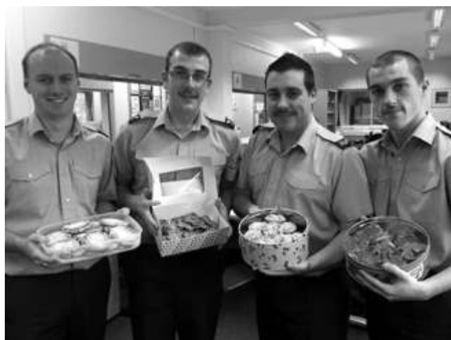
Baking talents on display from Personal Services Flight

As we all turn our attention to Christmas; with presents, holidays and the turkey dinner, our thoughts also turn to those who will be away from home during the festive period, serving on Duty around the world. We will be