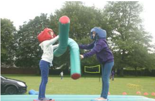
It's a Knock-out comes to Naphill