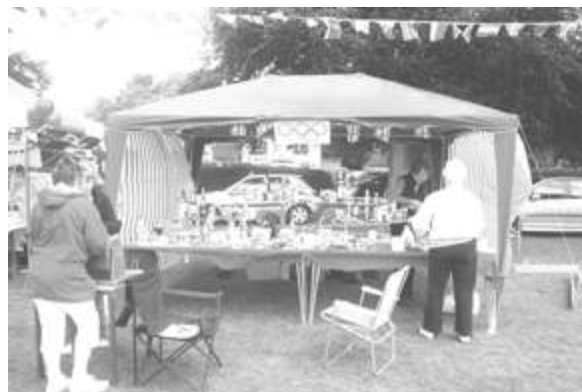
Braving the wind at the WI Tombola Stall