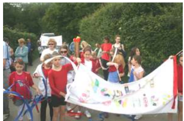
Best Walking Tableau – Naphill Brownies