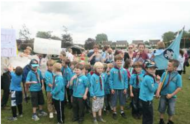
The Beavers arrive on the Crick