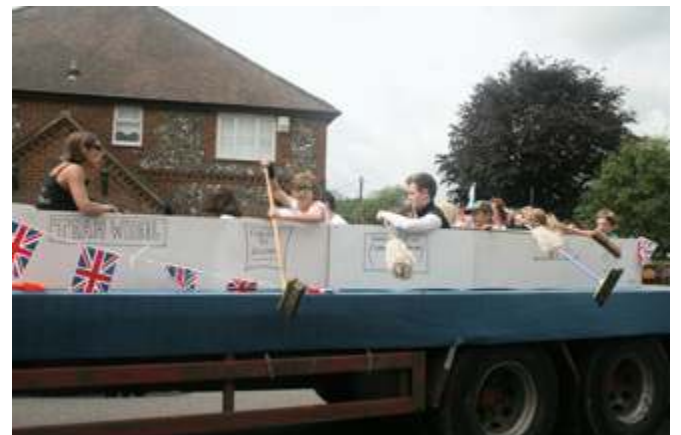
The Black Lion and The Wheel row with their mops