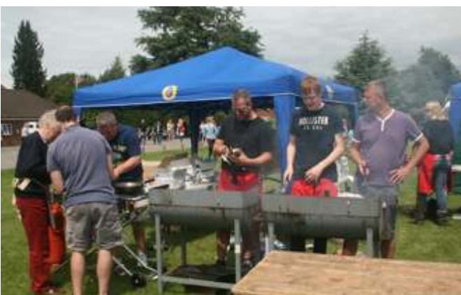
A never ending supply of sausages