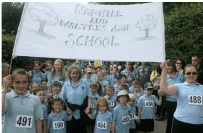
A fantastic turn-out from NWA School