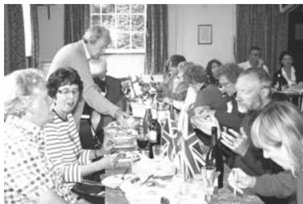
The indoor Jubilee Picnic