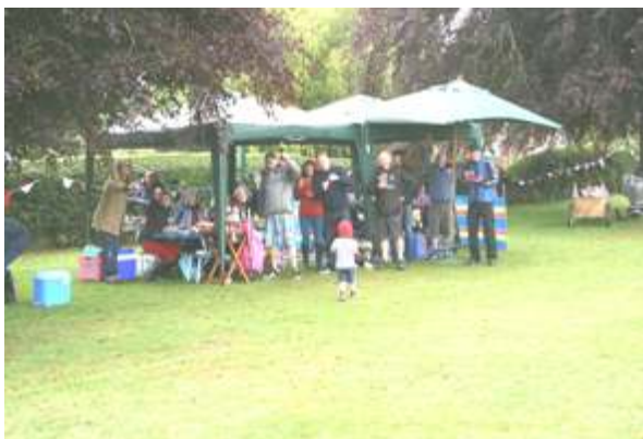
The hardy outdoor Jubilee Picnic!