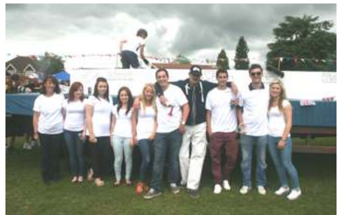
The pub team return to dry land