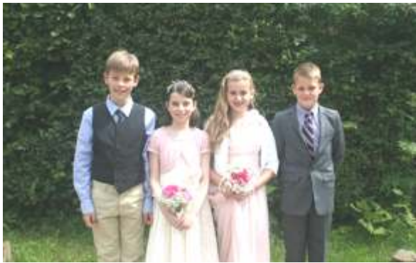
The Fete Princes and Princesses

Wow! What a fabulous day, I cannot believe how lucky we were with the weather. The procession was amazing with our gorgeous Fete princes and princesses being driven in open top cars provided by Sytner, a BMW and a Mini followed by the walking tableaux and floats. The crowd of people that walked down with the procession was immense and the scene was breath taking.