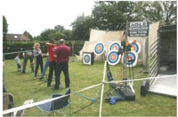
Trying their hand at archery

coconut shy, which all bring everyone's competitive streak out!