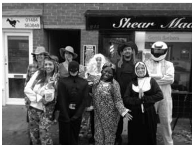
Having a laugh for Children in Need

Most of all we would like to wish you all a very Merry Christmas and a happy New Year and thank you all for your continued support.