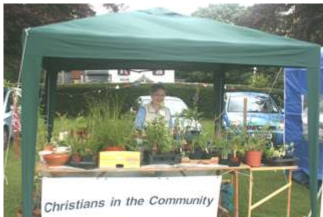
Plants for sale from Christians in the Community