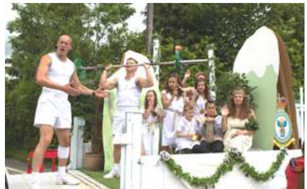
Best Senior Float – The RAF