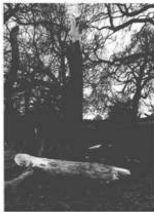
Fallen tree in Hughenden Park

'The Brands Fee Committee of the Parish Council decided to take advantage of the dry weather to have