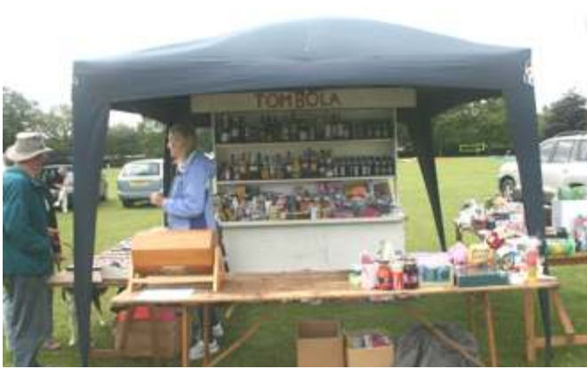
Lots of variety at the tombola