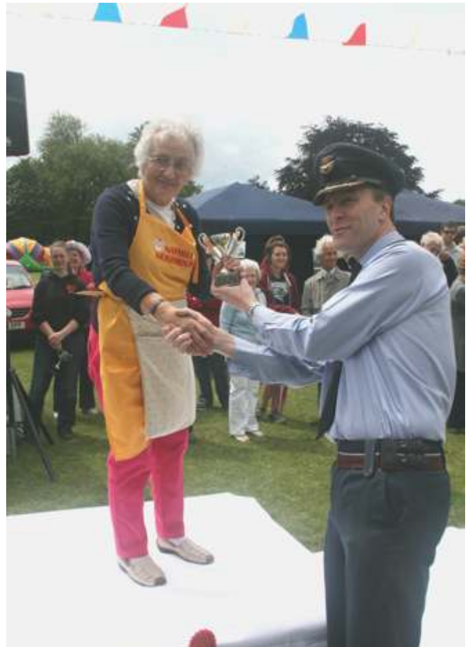
Naphill Neighbours win Best Stall