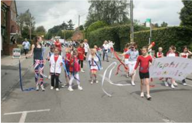
A prize winning tableau from the Brownies