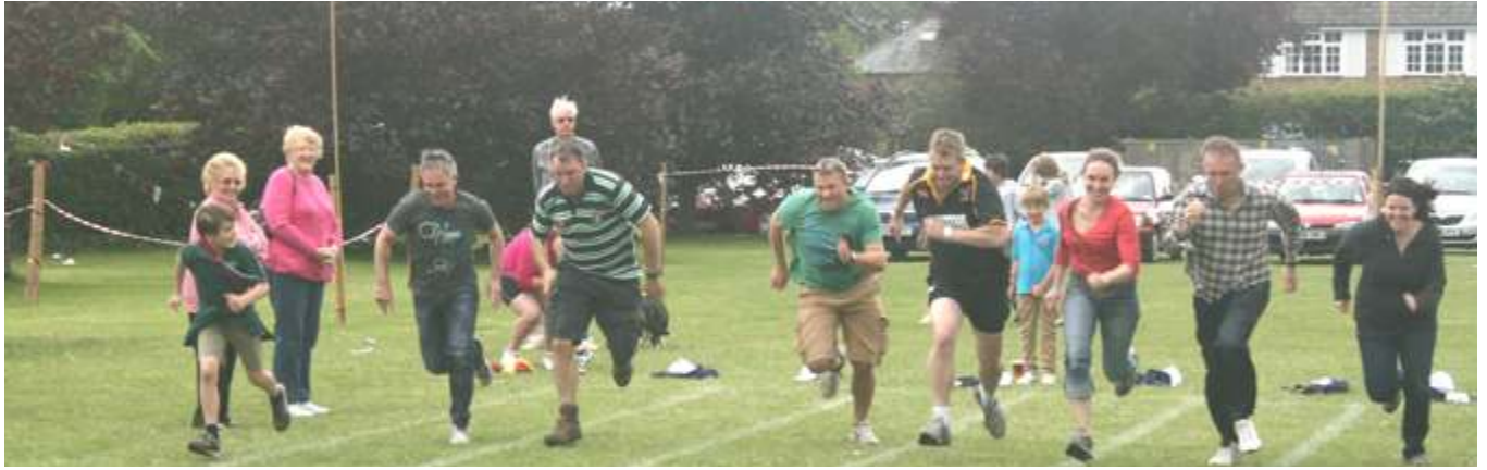
It's a serious business, running races...